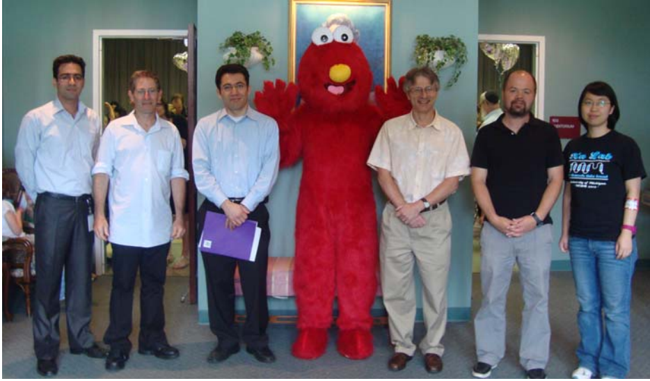
ML4 Doctors and Scientists pose with "Elmo"