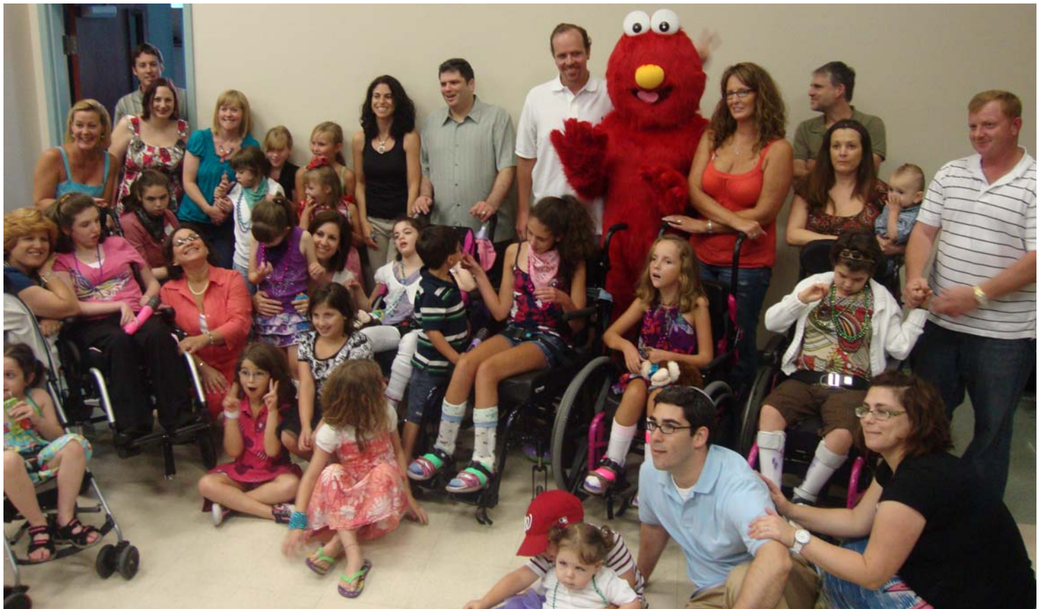
Group Photo of 2010 “ML4 Family and Friends Fun Day”

It was a fun day, an educational day, and a day filled with caring families, creating and nurturing lifelong friendships.