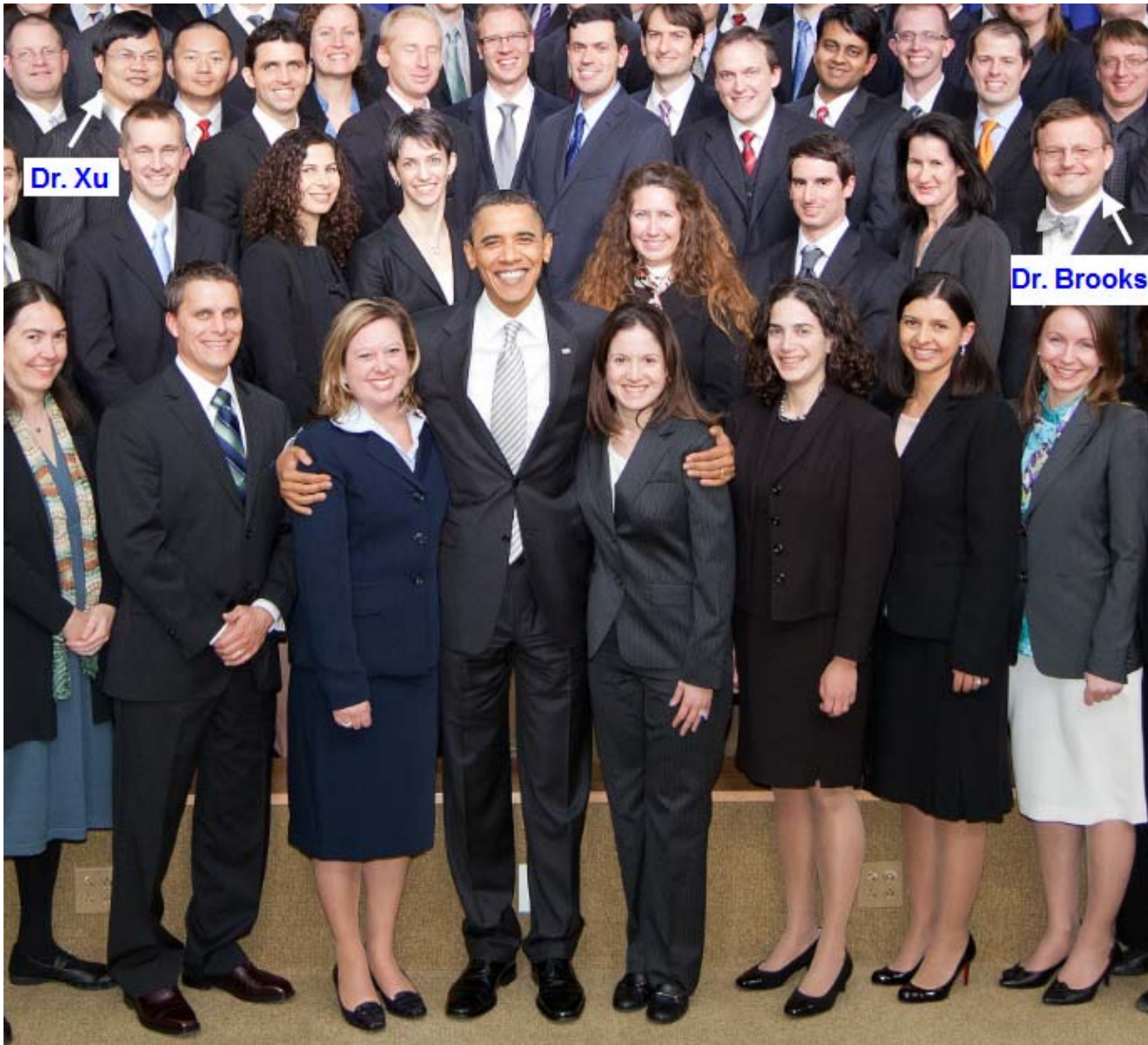
President Barack Obama poses for a group photo with the recipients of the Presidential Early Career Award for Scientists and Engineers in the South Court Auditorium of the White House Dec. 13, 2010.

The Presidential Award is the highest honor bestowed by the U.S. government on outstanding scientists and engineers beginning their independent careers.